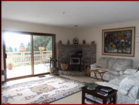
Main Level Family Room