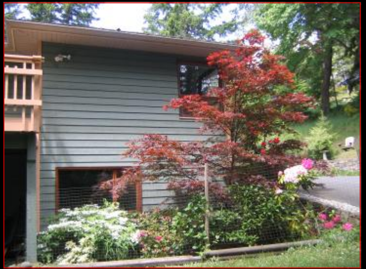
East Facing Red Maple