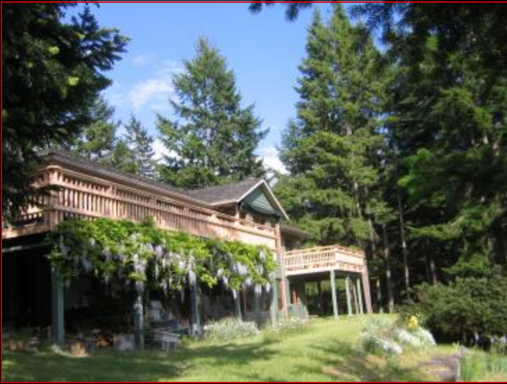
South Aspect With Wisteria